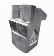
Tooth type STCH/SD