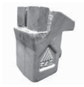
Tooth type STCH