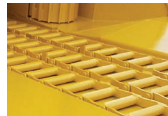
Feed chains & rollers combine for reliable feeding