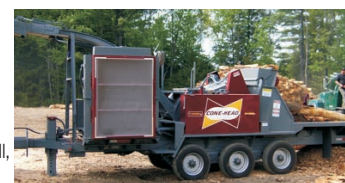
Reversing fan & auxiliary oil cooler are standard

* Specifications are subject to change without notification. Illustrations may not reflect actual product design. Consult dealer for available options.